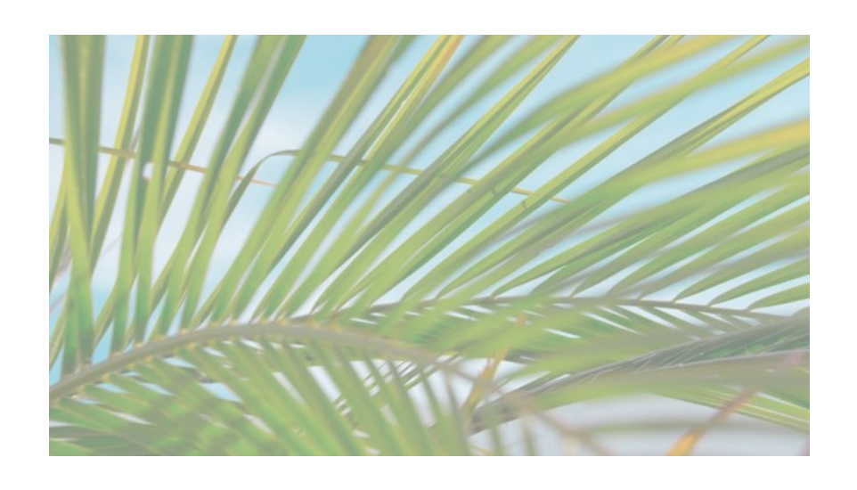
The Entry Into Jerusalem